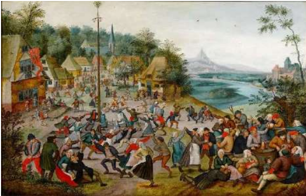
Pieter Bruegel the Younger (1564 - 1638) St. George's kermis with the dance around the maypole oil on panel, 50.5 x 77.8 cm Galerie De Jonckheere, Switzerland