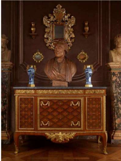
Formerly in the collection of leading French Naturalist, Georges-Louis Leclerc (1707-1788), Comte de Buffon. Attributed to Martin Carlin (1730-1785) Commode, Paris, Transition period, circa 1770. Marquetry on a carcasse of oak; gilt-bronze mounts and Sainte Anne marble slab H. 97 cm. ; L. 134.5 cm. ; D. 64.2 cm. Steinitz, France