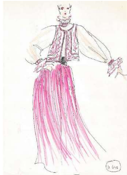
Formerly in the collection of Karl Lagerfeld Set of 70 original sketches by Karl Lagerfeld dating from his stint at Chloé (1963-1983) Autographes des Siècles, France