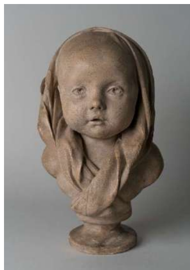
Jean-Antoine Houdon (1741-1828) Bust of an infant from the de Bourge family, 1786 Patinated plaster, H. 29 cm Trebosc + Van Lelyveld, France