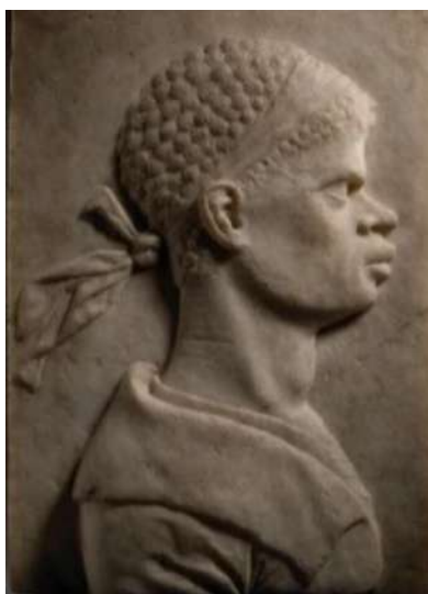
White Marble Head of an African Noble Man North-Italy (possibly also Florence), circa 1500-1520 47 cm (18½ in.) high 33 cm (13 in.) wide Desmet Fine Art, Belgium