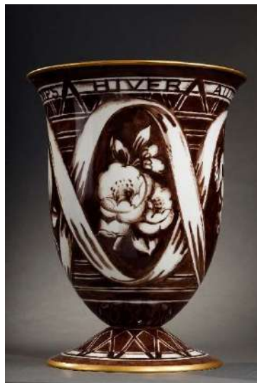
"Four Seasons" Vase, 1935

Galerie Anne-Sophie Duval, France