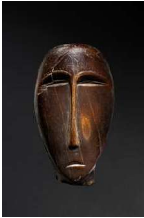
Large Okvik Head, circa 200 BCE - 100 AD Old Bering Sea I culture (Archaic Eskimo), St Lawrence Island, Alaska Fossilized walrus ivory, H. 7.8 cm Photo : © Vincent Girier-Dufournier Galerie Flak, France