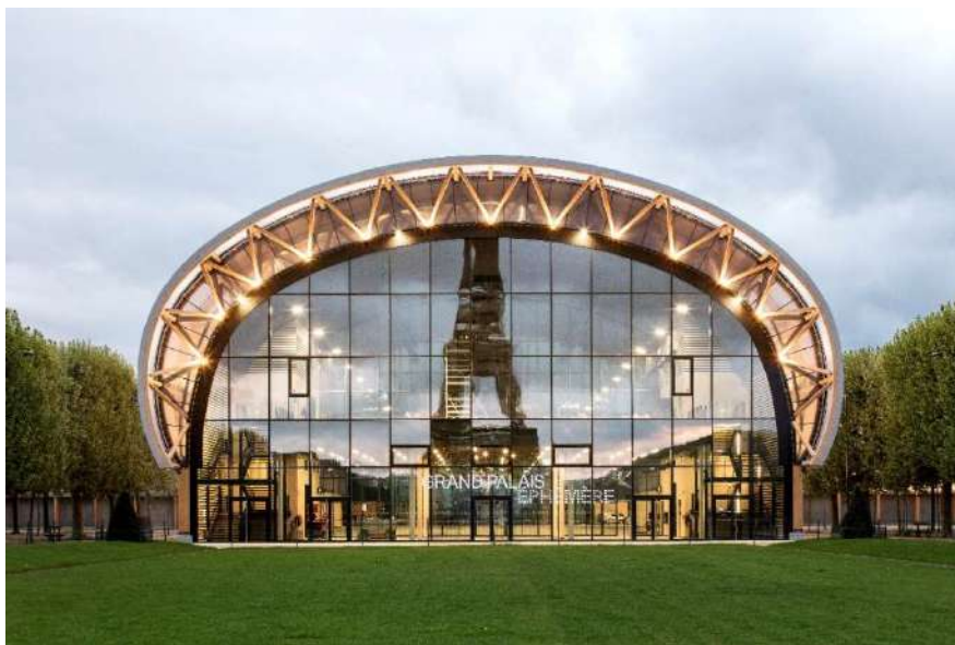
Grand Palais Éphémère