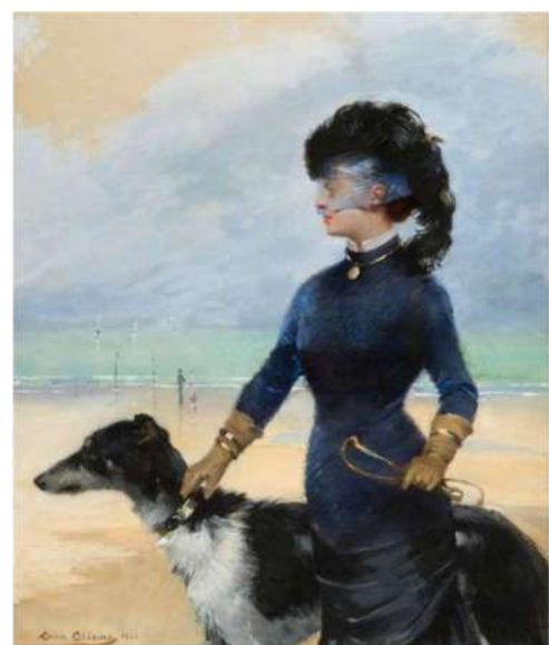
Louise Abbéma (1853 - Paris) Lady walking a greyhound on a Normandy beach , 1880 Gouache, 62,5 x 52 cm Horizon chimérique, France