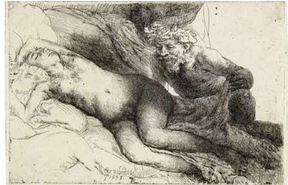
Rembrandt Harmenszoon Van Rijn (1606 - 1669) Jupiter and Antiope: The Larger Plate , 1659 Etching, drypoint, and burin on paper, 13.7 x 20.4 cm Kunsthandlung Rumbler, Germany