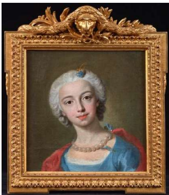
Louis-Michel Van Loo (1707–1771) Portrait of the Infanta María Antonia Fernanda de Borbón, Daughter of King Philip V of Spain, circa 1743 Oil on canvas, 39.5 x 39 cm