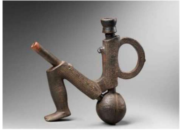
Makonde anthropomorphic pipe, early 20 th century Tanzania or Mozambique H.32.5 cm One of only four similar pieces, two of which are in a museum Bernard de Grunne, Belgium