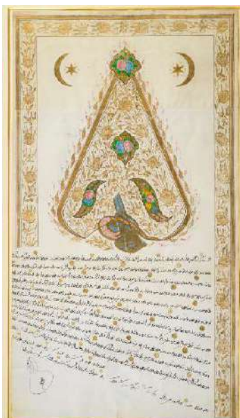
LEFT: Finely Illuminated Ottoman Firman with the Tughra of Sultan Abdulmecid (r. 1839-1861) Ottoman Empire, dated 1256 AH/1839 AD, 123 x 78 cm Kent Antiques, United Kingdom