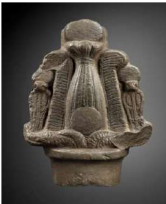
Rare statue fragment depicting a crown associated with Ramses II, circa 1279-1213 BC, Reign of Ramses II, 19 th dynasty of Ancient Egypt. Greywacke, H. 25cm, W. 25cm, D. 14.5cm Cybèle, France