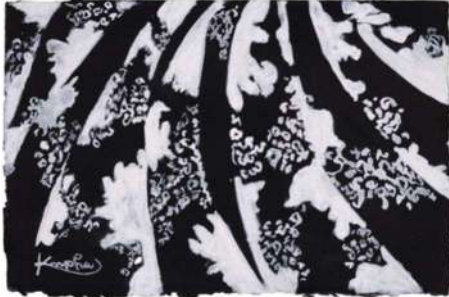
František Kupka (1871 - 1957) Black and white composition, circa 1924 Gouache and Chinese ink on paper, 16 x 25 cm Galerie AB, France