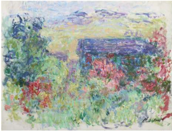
Claude Monet (1840-1926) La maison à travers les roses, Giverny, circa 1925-26 Oil on canvas, 24.5 x 32.1 in., 62,2 x 81,6 cm Von Vertes, Switzerland