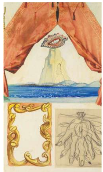
LEFT: Salvador Dalí (1904-1989) Jewellery Presentation project, 1949-51 Watercolour, gouache, pencil and collage on cardboard 30.2 x 18.4 cm Mayoral, Spain/ France