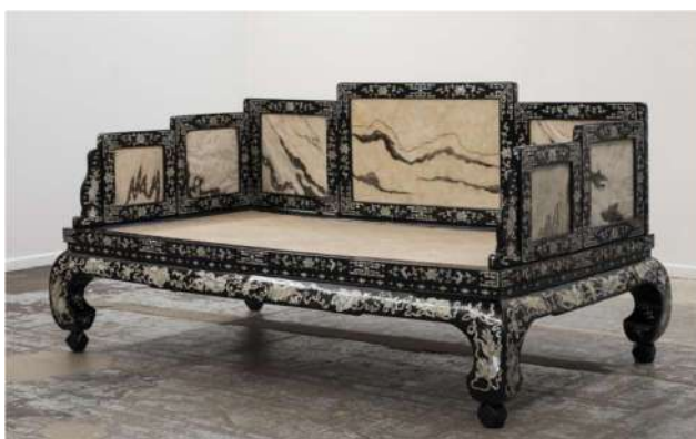
Luohan Bed Qing dynasty, late 18 th century, Shanxi Province, China Black lacquer with mother of pearl inlaid and Dali marble panels. The natural veins of the marble highlighted with Chinese ink 220 x 124 x H110.5cm A huanghuali piece with marble panels is kept in the Beijing History Museum Galerie Luohan, France