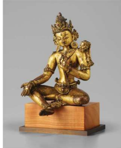
Bodhisattva Avalokiteshvara in the form of Padmapani Central Tibet, 12 th -13 th century Gilt copper alloy inlaid with semiprecious stones H. 21 cm Tenzing Asian Art, United States/ Hong Kong