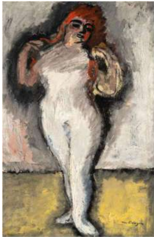
Kees Van Dongen (1877-1968) Le Maillot blanc, 1908 Oil on canvas, 81 x 54 cm Galerie Taménaga, France/ Japan