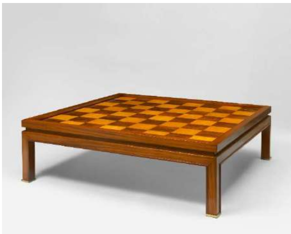
Jacques Adnet (1900-1984) Unique square-shaped Sapelli base coffee table, 1956 132 x 132 x 43 cm. Made for the Palais de Consuls in Rouen