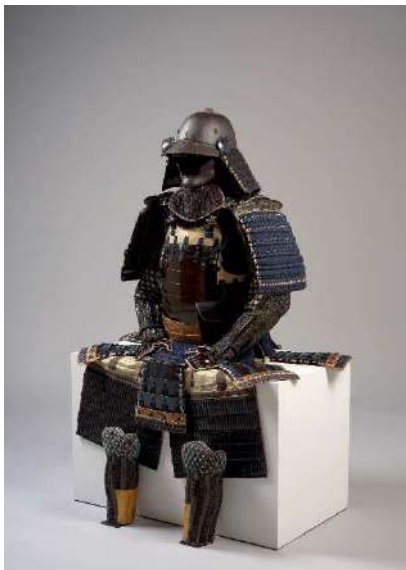
18-19 th -century Japanese armour iron, lacquer, silk, metal, leather Bearing the crest of the Yamaguchi clan which ruled the Ushiku fief in Itachi from 1628 until Meiji. H 132 cm / W 90 cm / D 68 cm Jean-Christophe Charbonnier, France