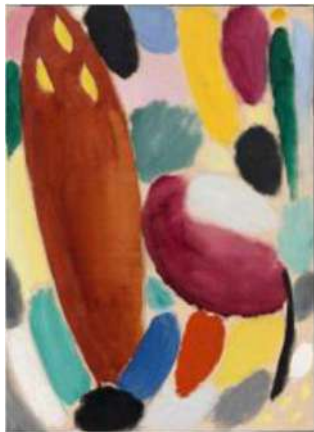
Alexej von Jawlensky (1864-1941) Variation: Fest , 1919 Oil on linen-structured card, mounted on cardboard, 36 x 27 cm Ludorff, Germany