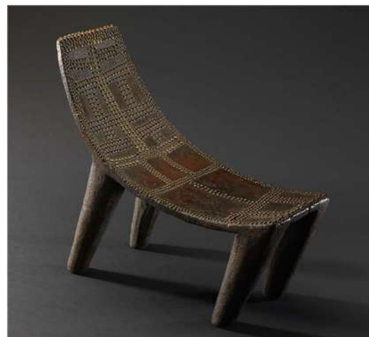
Formerly in the collection of Yves Saint Laurent Rare 19 th -century Ngombe stool Democratic Republic of the Congo Wood and brass nail, 59 cm high Fewer than two dozen of such stools are recorded today. One of the most iconic designs of African stools, it has inspired a quasi-identical stool to Art Deco designer Pierre Legrain in the 1920s Schoffel de Fabry, France