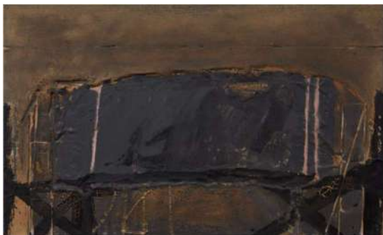
Antoni Tàpies (1923-2012) Gris amb tres ratlles roses ( Gray with Three Pink Lines ), 1964 Mixed media, oil and sand on canvas 97 x 146 cm (38 14/ x 57 12/ in.) Mayoral, Spain