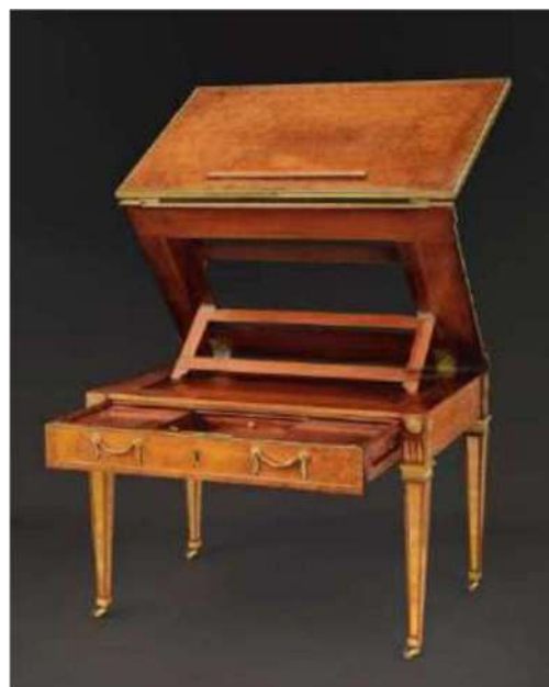
Made for the children of Louis-Philippe-Joseph d'Orléans, Cousin of King Louis XVI David Roentgen (1743-1807) Children desk « à la Tronchin », circa 1785 gilt-bronze and tuya, H: 47,5 cm, L: 67,5 cm, P: 45 cm Galerie Neuse, Germany