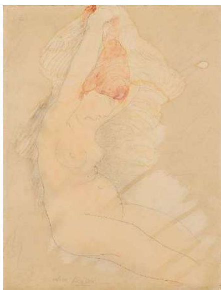
Auguste Rodin (1840-1917) Seated female nude combing her hair Graphite, watercolor, and gouache (32.4x24.8cm) Galerie de Bayser, France