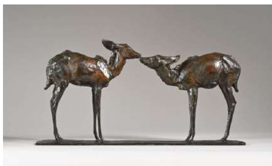
LEFT: Rembrandt Bugatti (1884-1916) Deux Antilopes Koudou or Caresse , circa 1911 Bronze n.9, « burnt bread » patina H : 25,2 cm, L : 51,5 cm, D : 7,7 cm Univers du Bronze, France