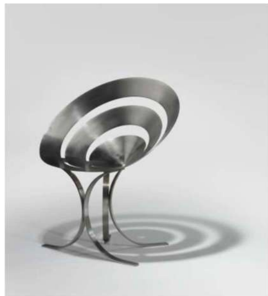
Maria Pergay (born in 1930) Chaise Anneaux / Ring Chair , 1968 Stainless steel H.70 cm Demisch Danant, New York