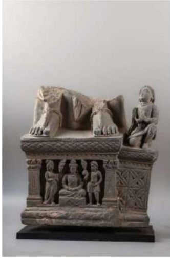
Gandhara Pedestal in grey schist Ancient region of Gandhara, 3 rd -4 th century H. 35 cm Galerie Hioco, France

This year's selection also celebrates centuries of Asian creation, from a Gandhāra pedestal - a rare vestige of the Indo-Aryan civilisation that flourished in the 3 rd -4 th centuries in what is now northwestern Pakistan – to exquisite creations by two contemporary Japanese artists: leading ceramicist Yukiya Izumita and Ryuhei Sako , known for his use of the 400-year-old mokume-gane ('wood-grain metal') technique and whose creations can be found in leading museums, including the Victoria and Albert Museum, London and The Metropolitan Museum of Art, New York.