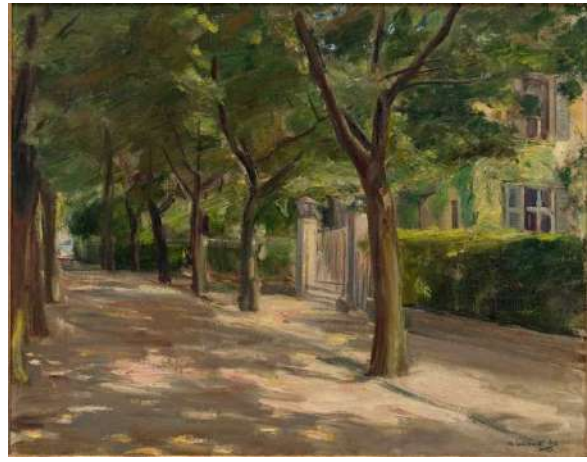
Max Liebermann (1847-1935) Colomierstraße in Wannsee, 1916 Oil on canvas 72 x 91 cm, 28 3/8 x 35 7/8 in Ludorf, Germany