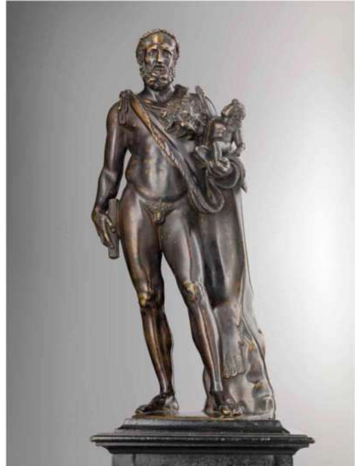
Most probably in the collection of Louis XIV's son, The Grand Dauphin de France (1661–1711) in the Palace of Versailles, Attributed to Hubert Le Sueur (1580–1658) Hercules and Telephus, circa 1630 Bronze, 39.4 x 15.9 x 12.4 cm A life-size version of this bronze, made for King Charles I of England, can today be found in the gardens of Windsor Castle. Benjamin Proust – United Kingdom/ France