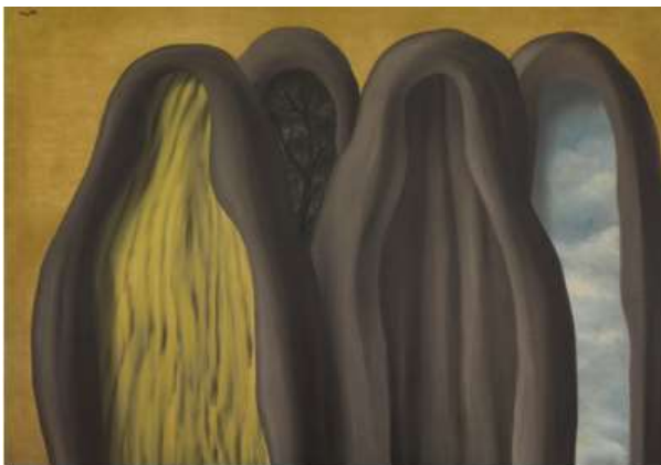
René Magritte (1898-1967) Le Palais de rideaux, 1928 Oil on canvas, 81 x 116 cm Galerie de la Béraudière, Belgium

Leading Surrealist artists will be represented at the fair. Among highlights is an early work by René Magritte , Le Palais des Rideaux , painted in Paris in 1928, a pivotal period in the artist's career during which he formulated his own definition of surrealism.