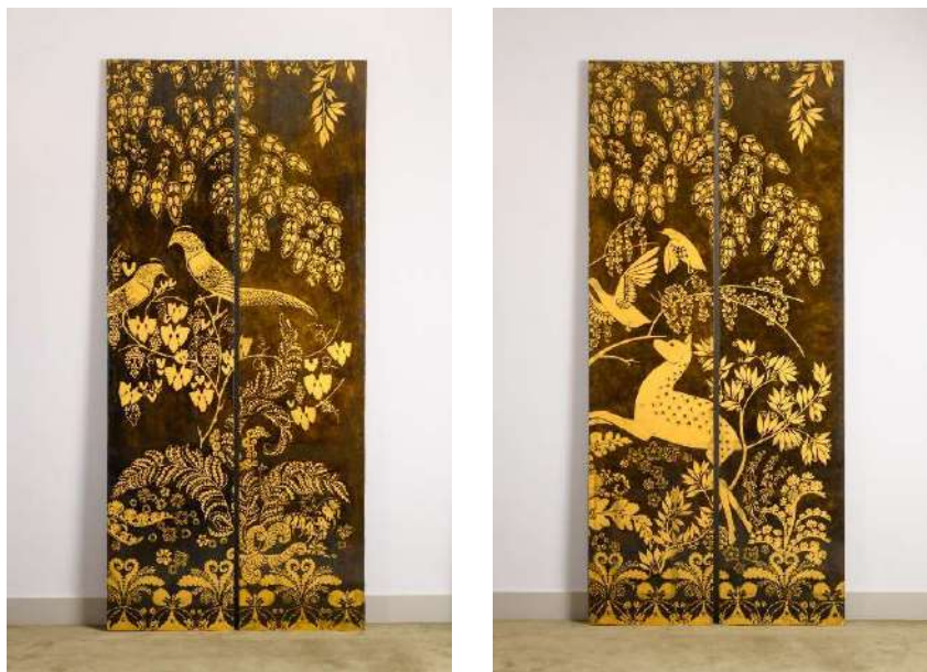
Two pairs of decorative lacquered panels by Armand-Albert Rateau (1882-1938)