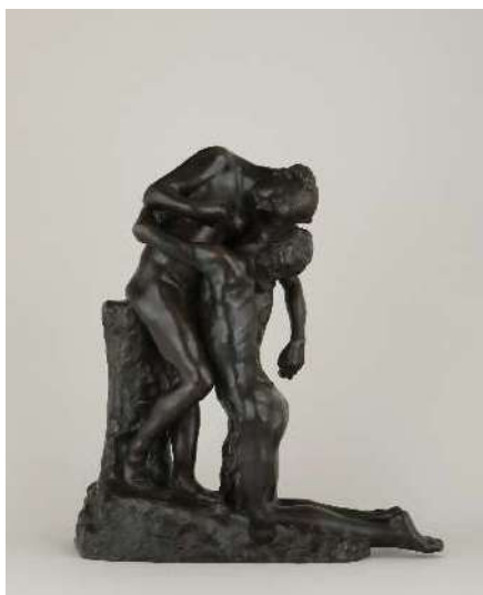
Camille Claudel (1864-1943) L'Abandon , small model, 1886-1905 Bronze, n°13, H. 43.1 cm Galerie Malaquais, France

Taking centre stage this year will also be a group of rare works by women sculptors led by Camille Claudel (1864-1943) - one of the most visionary sculptors of the late 19 th century – whose oeuvre is currently celebrated in a major US exhibition (at the Art Institute of Chicago this autumn and the Getty Museum this spring).