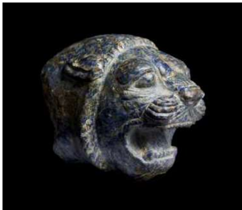
Achaemenid lapis lazuli lion's head Iran, Achaemenid dynasty, circa 5 th century BC Height: 4.2 cm; Length: 5 cm Kevorkian, France