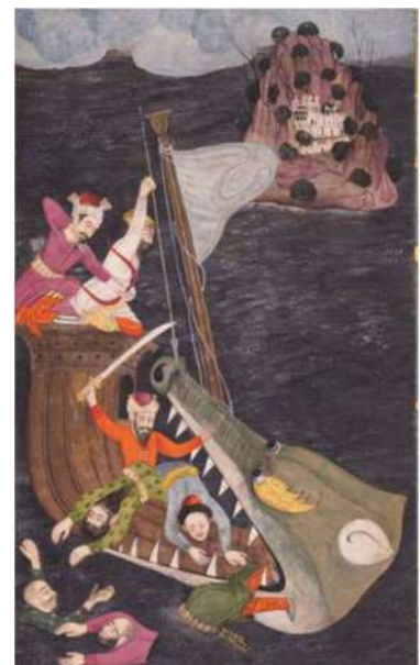
RIGHT: Rare folio from the Dastan-i Amir Hamza India, Rajasthan, Bikaner, circa 1680 Ink, watercolour and gold on paper 24,9 x 16 cm The Hamzanama (or 'Story of Hamza'), its usual abbreviated title, is a rambling series of tales dealing with the mythical adventures of Amir Hamza, the uncle of the Prophet Muhammad. Art Passages, United States