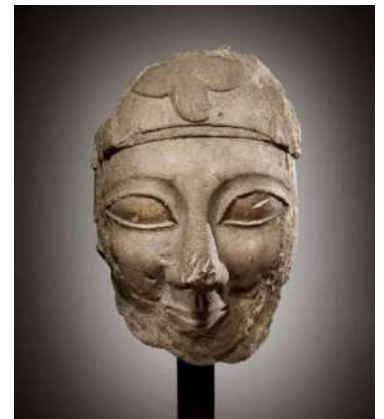
Monumental Cypro-Archaic head, Late 7 th -early 6 th century BC, H. 38.5 cm Formerly in the collections of General Luigi Palma di Cesnola (1832-1904) and the Metropolitan Museum of Art, New York Galerie Cahn, Switzerland