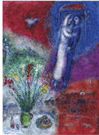
Marc Chagall (1887-1985) Les Mariés, 1979 Tempera on masonite, 110 x 80cm Galerie Boulakia, London